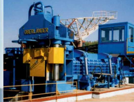
Pic. 1: 800 t Scrap Shear, Type Hy-PS 800