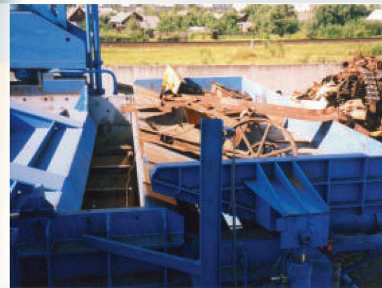
Pic. 3: View into the filling box

Large hydraulic pipe and valve cross sections lower oil turbulence and result in a higher power yield.