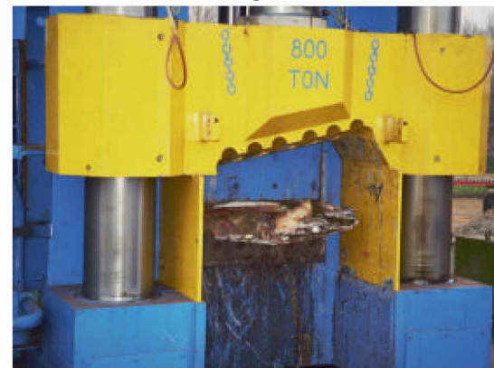
Pic. 4: View on the shear head with cylindric guides (guide covers removed)