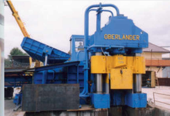
Pic. 2: Front view, 800 t Shear, Type Hy-PS 800

The design of the ORM press shears is based on more than 35 years of approved Oberländer concept with cylindric guides for the shear head ensuring a precise cut between the upper and lower blades. Adjustment of the guides is not necessary. The shear is build within a robust, twist resistant welded construction allowing installation directly onto concrete without anchorage and therefore having low foundation costs.